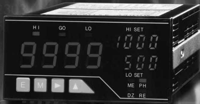
Display multiple type (A5X2X-XX)