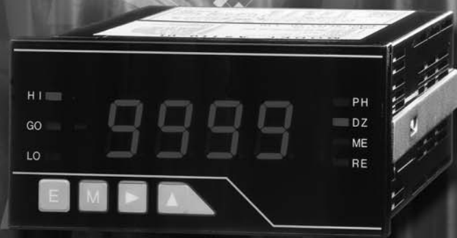
Display single type (A5X1X-XX)